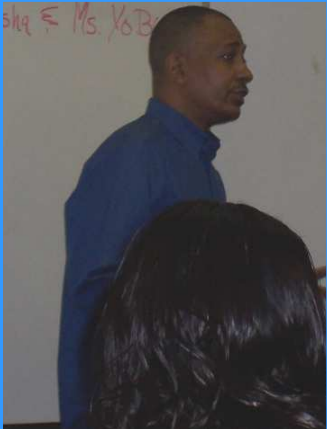
You must be the CHOOSER, not the CHOSEN.