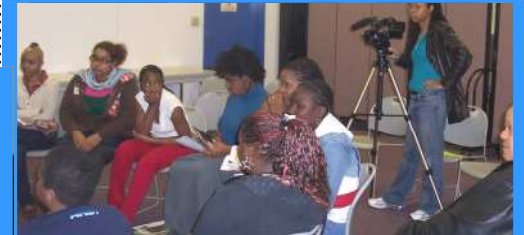
What do you plan to do with your life?

ACTIONS, BEHAVIOR, CHOICES AND DECISIONS HAVE AN EFFECT ON YOUR FUTURE!