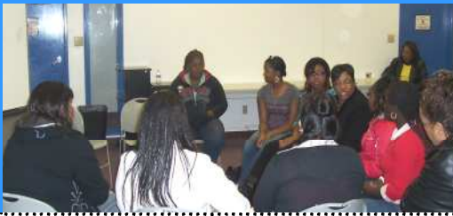
You cannot control who your Mama and Daddy are or what kind of parents they are but you can control who you are by the choices you make.