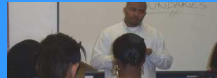
You must establish boundaries.