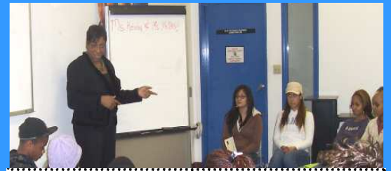
ABC's of Life are simple. You are responsible for your Actions, Behaviors, Choices and Decisions... they have an Effect on your Future!