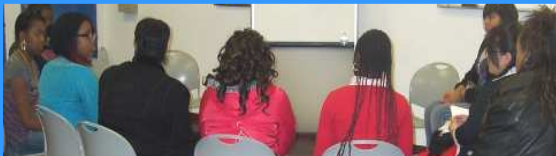
Success has nothing to do with money.